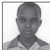
538104/008 AMUMPAIRE LYNATE 5 AGG