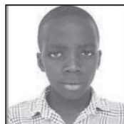
538104/029 EUPAL JAIRUS 6 AGG